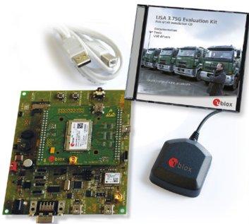
EVK-U23 evaluation kit for the LISA-U2 universal UMTS module series

The EVK-U23 evaluation kit includes m-center and u-center : u-blox' interactive evaluation tools for configuration, testing, visualization and data analysis of wireless and GPS receivers. These powerful and easy to use tools provide useful assistance during all phases of a system integration project.