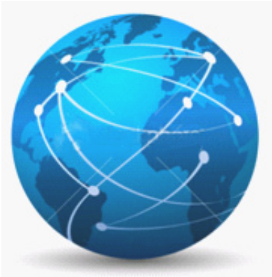
Global UMTS frequency coverage

Capitalizing on the advantages of combined Wireless/GPS technologies requires more than simply connecting a wireless modem to a GPS receiver: many design considerations must be taken into account especially when selecting the wireless modem: