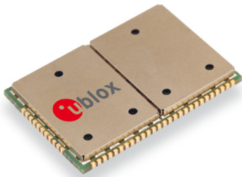
u-blox' LISA SMT (LCC) modem module