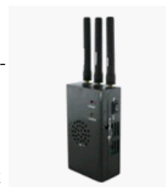
Easily obtainable GPS jammer

Using GPS systems to track stolen goods is easily thwarted via inexpensive GPS jammers. Integrated jamming detection intelligence can therefore help prevent theft before it begins: the detection of a GPS jamming signal by the GPS receiver can put a system into an alarm condition, while sending out an alert signal via 3G modem. This is especially attractive for vehicle-theft and asset management systems. Jamming detection is a feature of both LEON and LISA modem families.